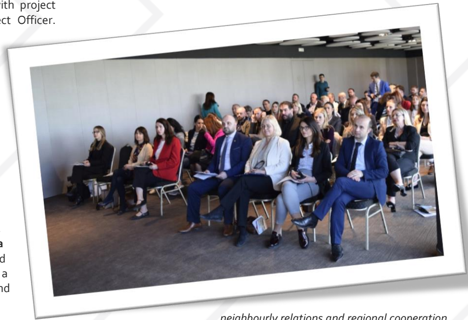
neighbourly relations and regional cooperation are crucial for joining the EU," he emphasized.